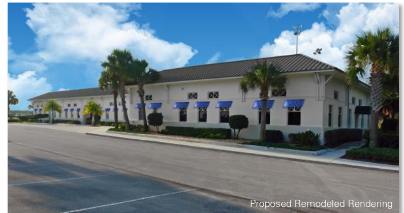
Proposed Remodeled Rendering

Jeremiah Baron & CO. Commercial Real Estate, LLC