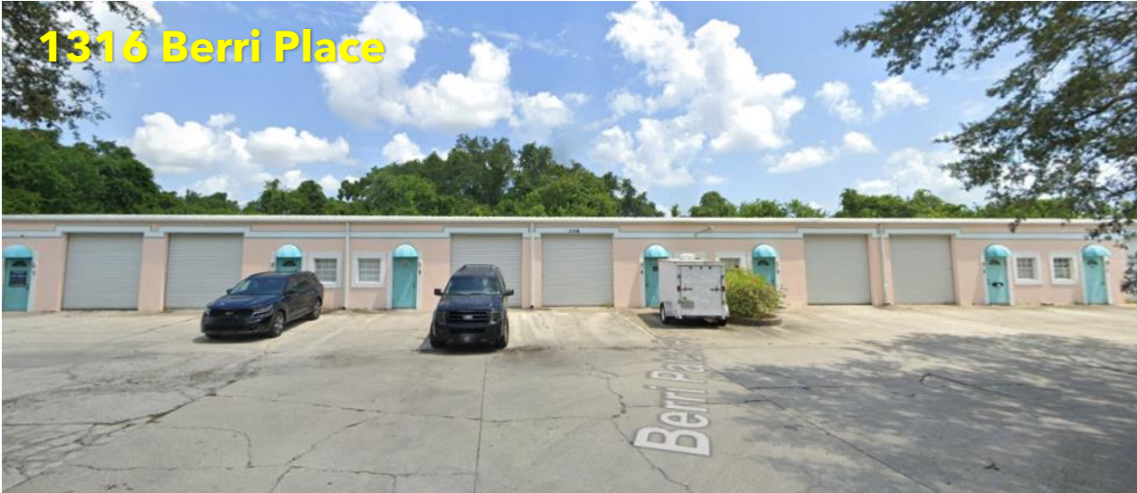
1316 Berri Place